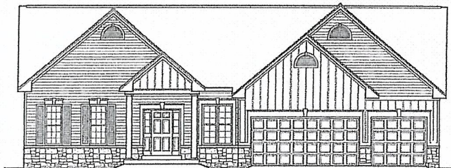
SECTION WITH OPTIONAL STONE BASE